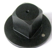
SQUARE DRIVE REDUCER