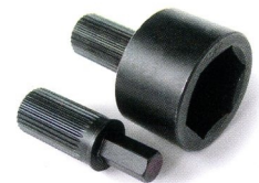
DIRECT DRIVE SOCKETS DIRECT DRIVE ALLENS