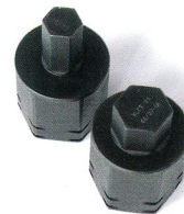
LOW CLEARANCE ALLEN DRIVES