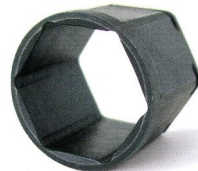
LOW CLEARANCE HEX INSERT